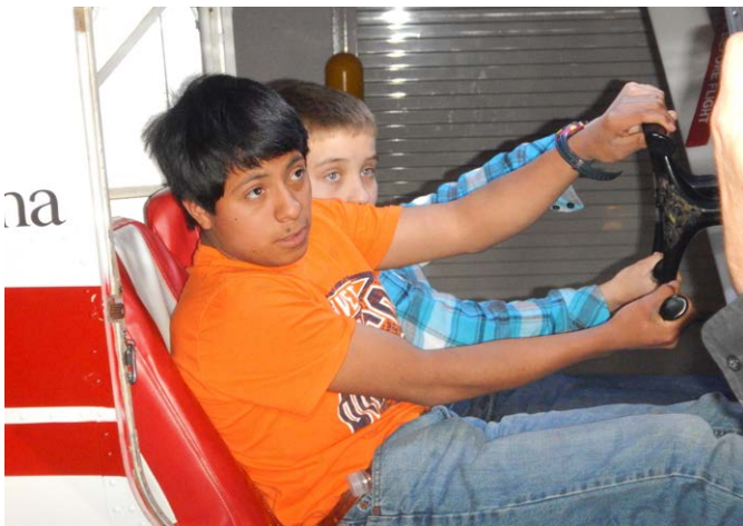
Educational Trips are an Important Part of Camp