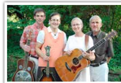
Good News Bluegrass Gospel Music

A free-will offering will be received to benefit Fair Play Camp School.