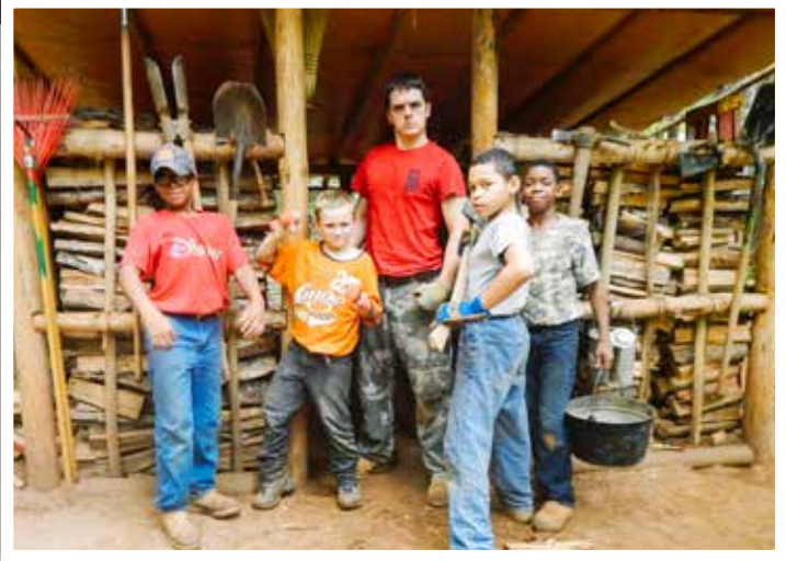
Making Men out of Boys

when the group stuck together to resolve them. “Working through a difficult problem brought them closer together,” he said. “Boys would feel that their chief and group really cared about them. I went from dreading a problem to enjoying a big problem and working through it. It’s way more powerful when the whole group is doing it together.”