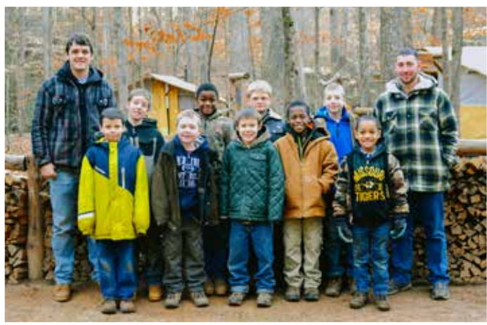
“It ended up changing me as much as the boys!”

While solving problems is difficult, Andrew enjoyed