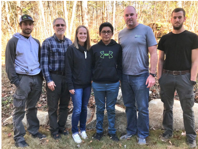
A camper's support team includes his family, his chiefs, family worker, support staff, and generous donors like you!

If you can help, thank you. If not, we certainly understand. Together, with God's help, we can and will get through these tough times. May God bless you and your family as we serve those in need all around us.